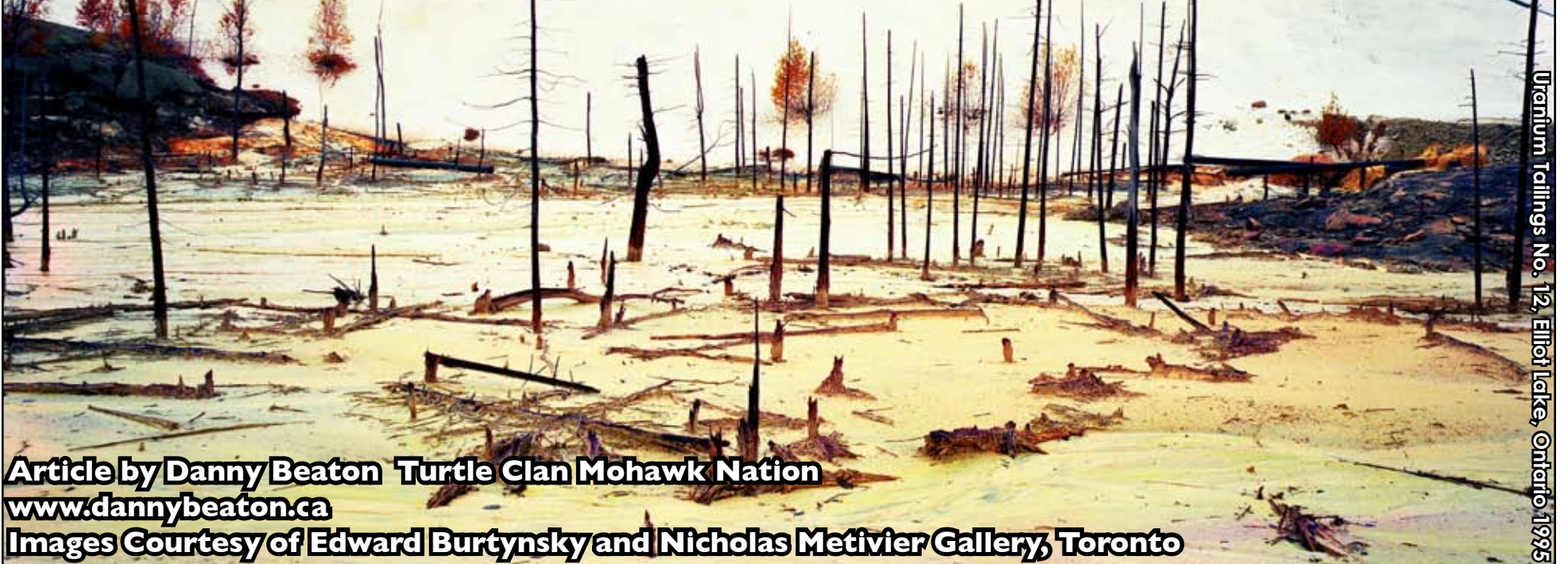
Uranium Tailings No. 12, Elliot Lake, Ontario, 1995